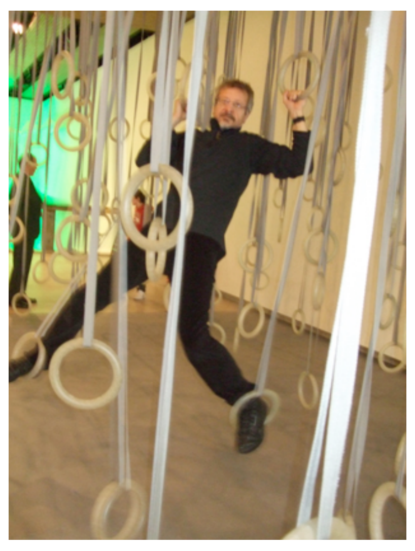
Fig. 1 William Forsythe, The Fact of Matter, MOVE: Choreographing You, 2010.

The Fact of Matter, as Forsythe titled a recent installation made for the exhibition Move: Choreographing You (Hayward Gallery, London), was neither a choreography nor a dance, as a matter of fact. Informal yet materially concrete, it pretended to be a "choreographic object" and looked like a loose gymnastics sculpture waiting to be acrobatically entered. I entered and hung in the ropes for a while, trying to float my body and climb through the rings, losing and gaining momentum, getting trapped in the physical crisis of effort. But what is this installation, and how could it choreograph me?